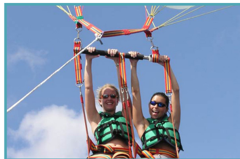
PARASAILING - GREAT STIRRUP CAY